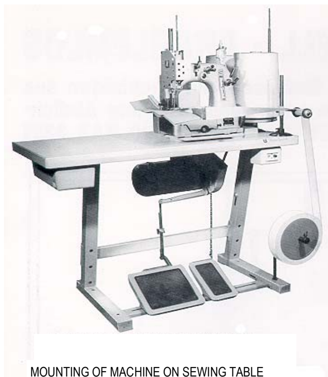
MOUNTING OF MACHINE ON SEWING TABLE WITH CLUTCH MOTOR